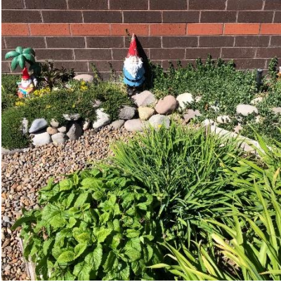
A small section of the Robin Ippoliti Memorial Garden in the Ashbrook Courtyard