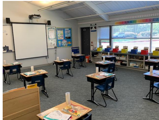
2nd Grade classroom ready to go!